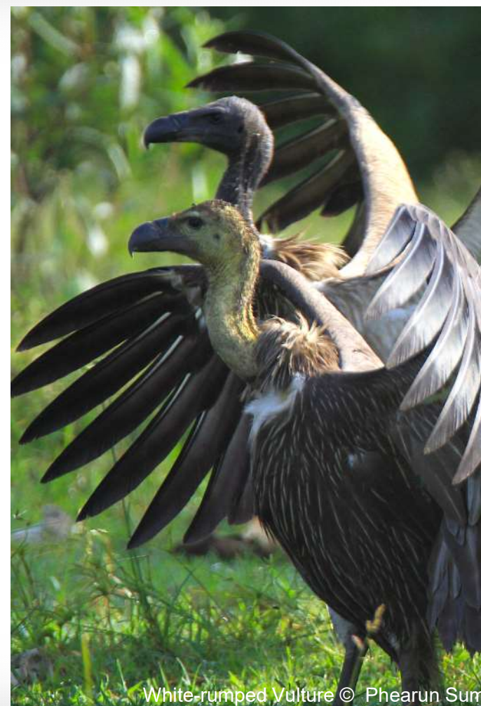
White-rumped Vulture