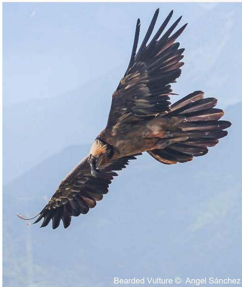
Bearded Vulture © Angel Sánchez